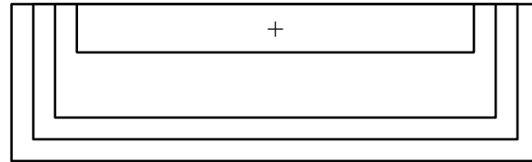
MC AC 2 - Th - AC 1